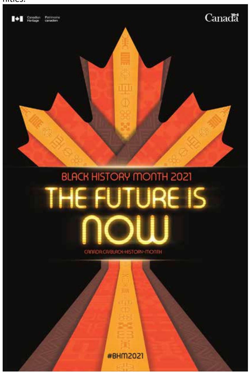
The 2021 theme for Black History Month is: "The Future is Now".

Every February, people in Canada are invited to participate in Black History Month festivities and events that honour the legacy of Black Canadians and their communities.